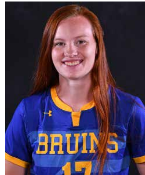
#17 Emma Stone